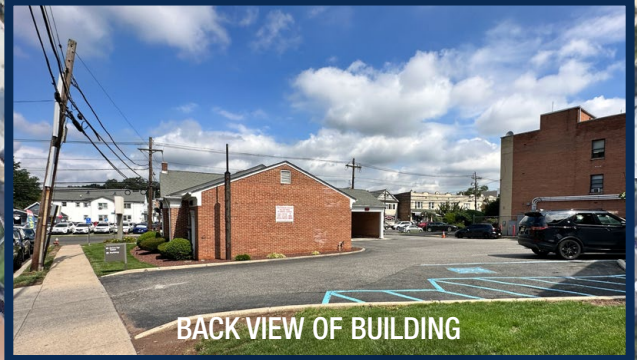
BACK VIEW OF BUILDING